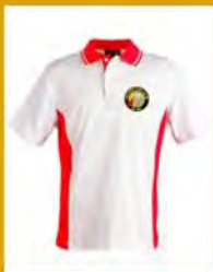
HCCoWA Polo Shirt (white) A$40.00 Low stock