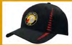
HCCoWA Peak Cap A$15.00