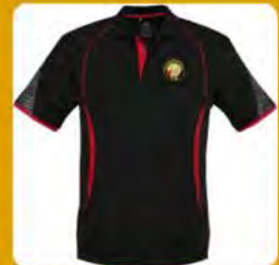
HCCoWA Polo Shirt (black) A$40.00 Low stock