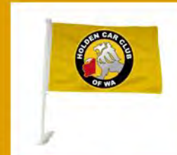
HCCoWA Vehicle Display Flag A$20.00