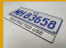
RESTRICTED USE Number Plate Display A$25.00