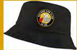
HCCoWA Bucket Hat A$15.00