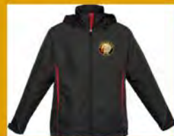
HCCoWA Spray Jacket A$60.00 Low stock