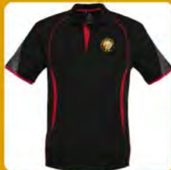
HCCoWA Children's Polo Shirt A$40.00 Low stock