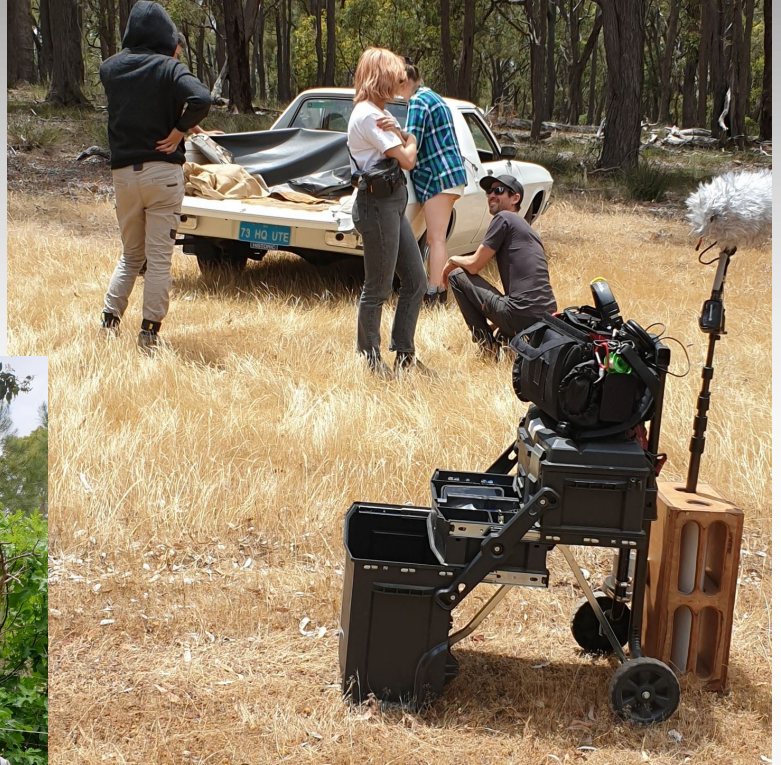
Eric Singleton (continued)