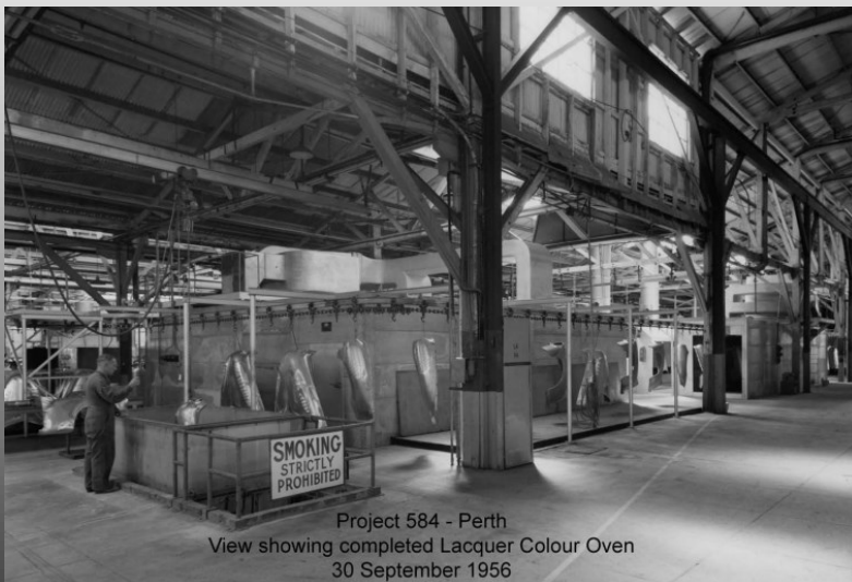
Project 584 - Perth View showing completed Lacquer Colour Oven 30 September 1956