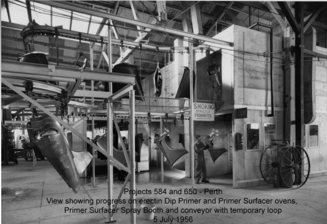
Projects 584 and 650 - Perth View showing progress on erecting Dip Primer and Primer Surfacers ovens, Primer Surfacers Spray Booth and conveyor with temporary loop 5 July 1956