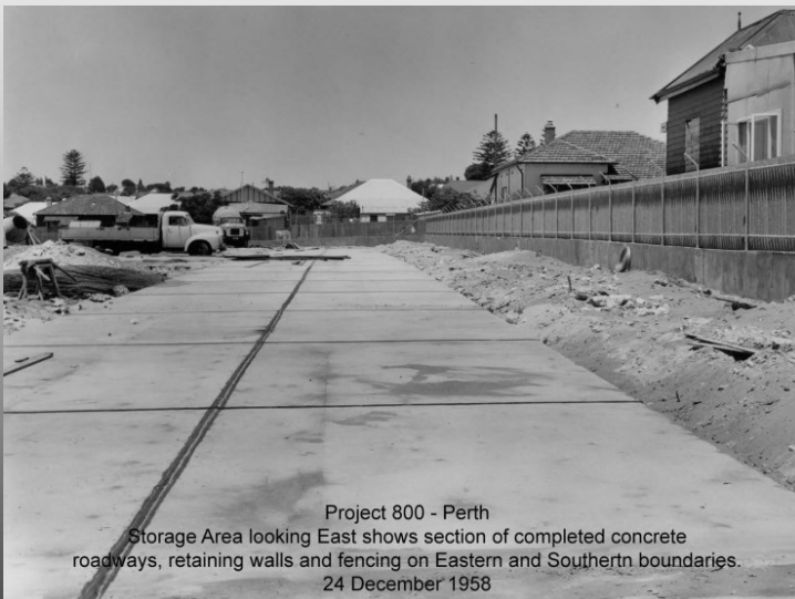
Project 800 - Perth Storage Area looking East shows section of completed concrete roadways, retaining walls and fencing on Eastern and Southern boundaries. 24 December 1958