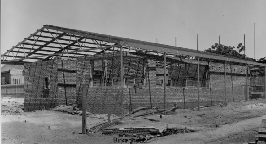
View looking South East showing progress of brick work and steel roof structure on Sales Distribution Building 24 December 1958