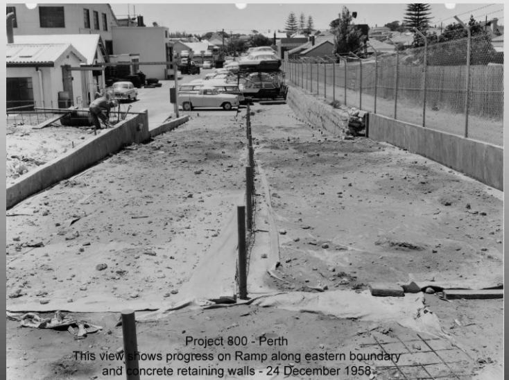
Project 800 - Perth This view shows progress on Ramp along eastern boundary and concrete retaining walls - 24 December 1958.