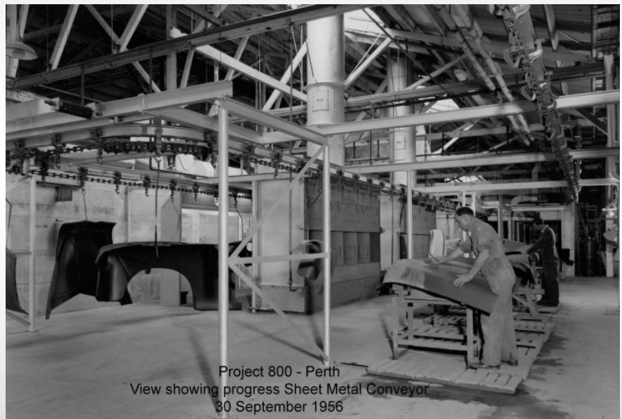
Project 800 - Perth View showing progress Sheet Metal Conveyor 30 September 1956