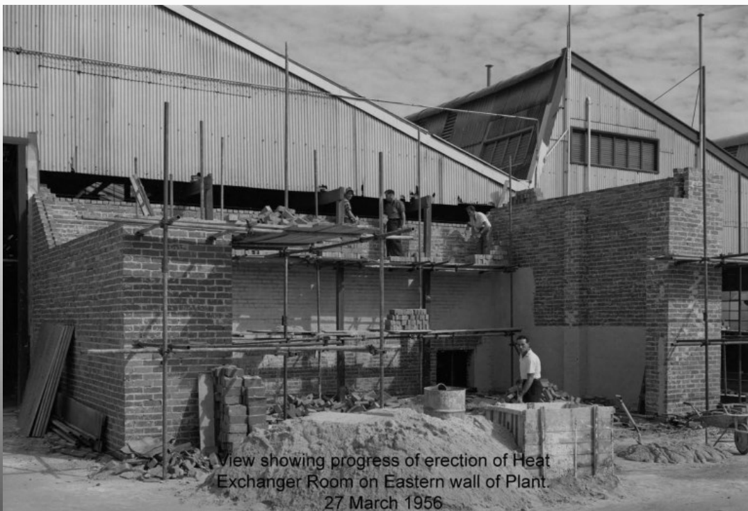
View showing progress of erection of Heat Exchanger Room on Eastern wall of Plant. 27 March 1956