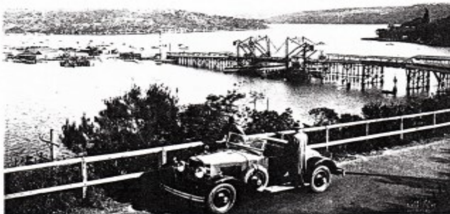
Spit Bridge, Middle Harbor, Sydney, with a La Salle roadster in the foreground

Coming at a time when the importation of cars and other material into Australia is not looked upon with favor by the government or by the public, the export to the United States of two Chevrolets so largely built of Australian material spread a tremendous amount of good-will and stimulated public interest in the work being done by General Motors in Australia.