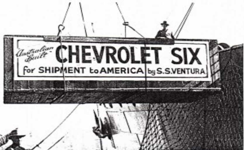
Sydney's version of a famous definition—"When an American-built Chevrolet is shipped to Australia, it is not news; when an Australian-built Chevrolet is shipped to America, it is news"

The boxes, as illustrated in the accompanying photograph, carried with huge signs featuring the event. The signs read, "Australian-Built Chevrolet Six — for Shipment to America . . ." The dispatch of the two cars to the dock was so timed