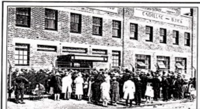
Crowds at the Perth Plant on opening day and afternoon tea served to visitors