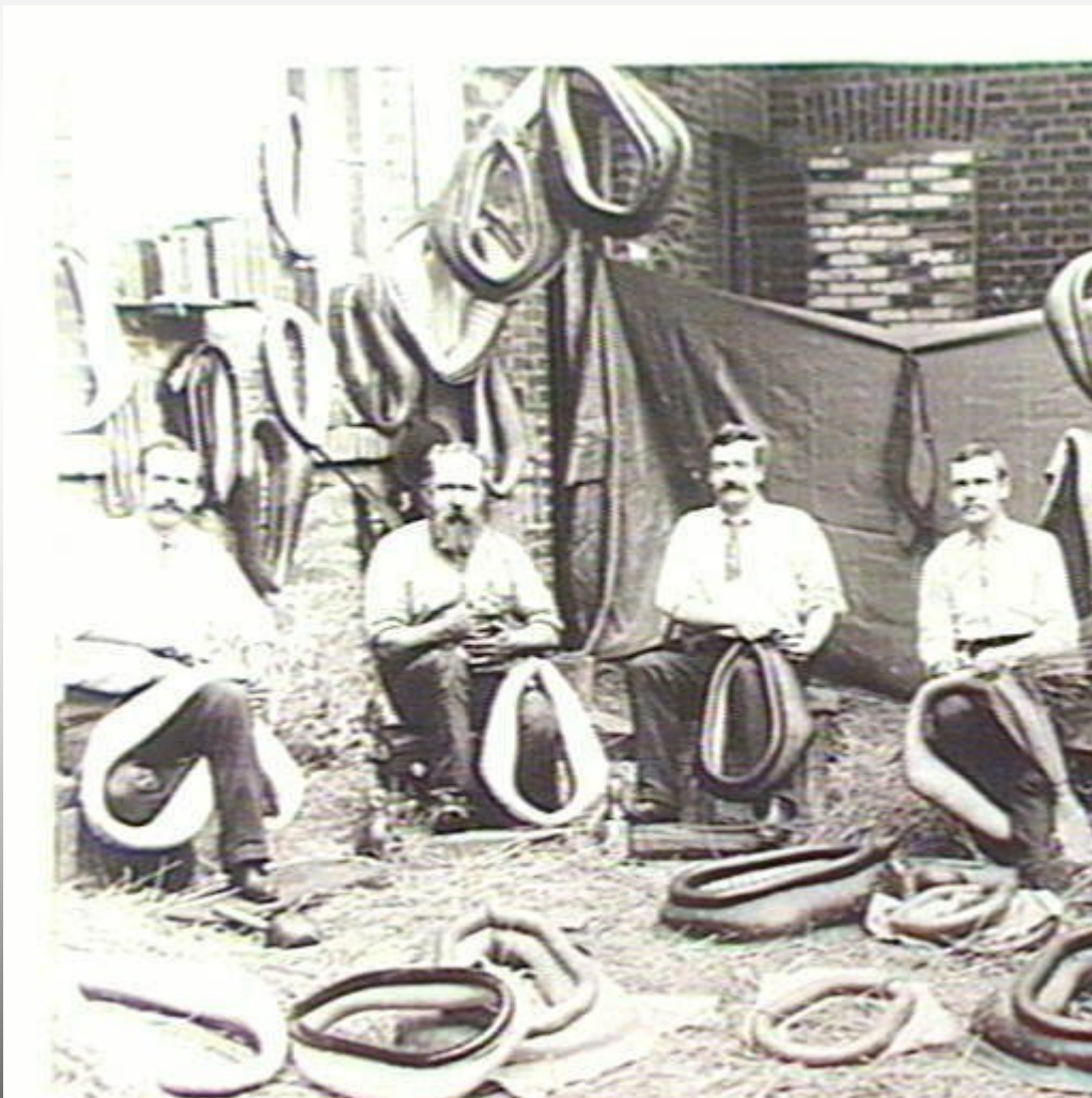
Pictured: Men pack straw into horse collars at what is thought to be Holden and Frost, harness makers