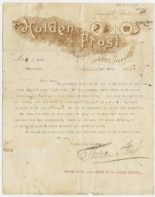
Pictured: A letter signed by Holden & Frost confirming an order of saddles to be sent to South Africa, dated December 20, 1899