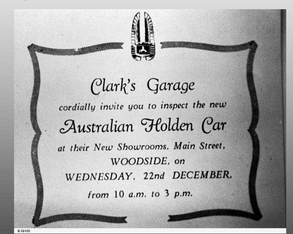
mage: an invitation to view the new Holden, c. December 1948 Image from the State Library of South Australia, B58105