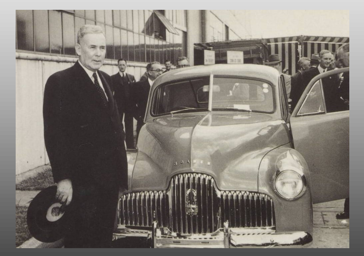
Image: The Prime Minister, Ben Chifley, stands with the first Holden automobile produced in Australia, November 29, 1948.

WWI saw new trade restrictions put in place that created increased demand for a fully home-grown automobile. Holden had been making bodies for imported chassis, but seized its opportunity to do more. After years of development, the first fully Australian-made Holden was unveiled on November 29, 1948 – by the Prime Minister himself, Ben Chifley! The Honorable verdict? "She's a beauty!"