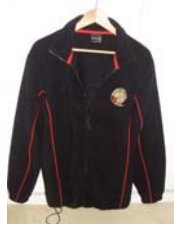
HCCWA Fleece Jacket $45.00