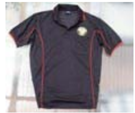
HCCWA Polo Shirt $28.00