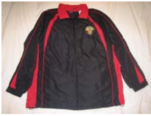
HCCWA Sport Jacket $60.00